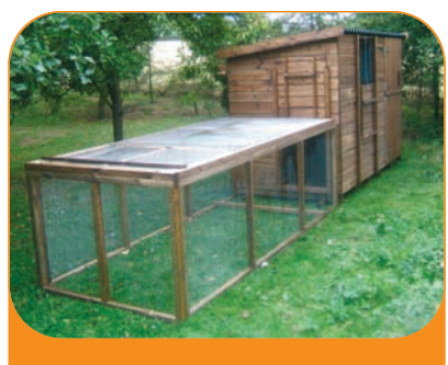
The Lodge size 3 with a run