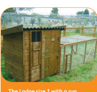
The Lodge size 1 with a run